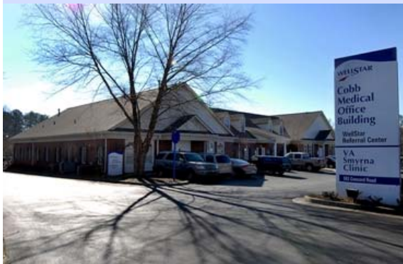
Smyrna CBOC 582 Concord Road SE Established in 2003