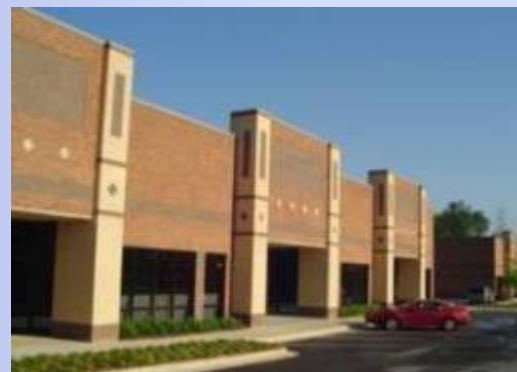
Stockbridge CBOC 175 Medical Blvd Established in 2008

Newnan CBOC projected activation 2009. Blairsville CBOC end of FY2010. Future locations based on enrollment. Existing CBOCs expanded as needed.