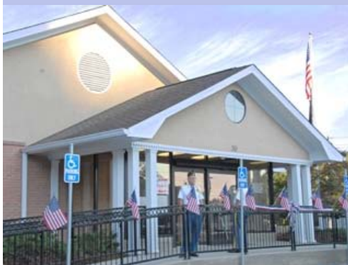
Rome Outreach Clinic 30 Chateau Drive SE Established in 2007