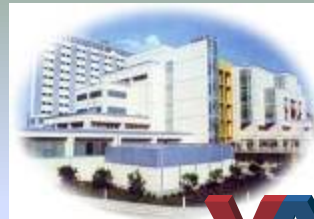
Atlanta VA Medical Center