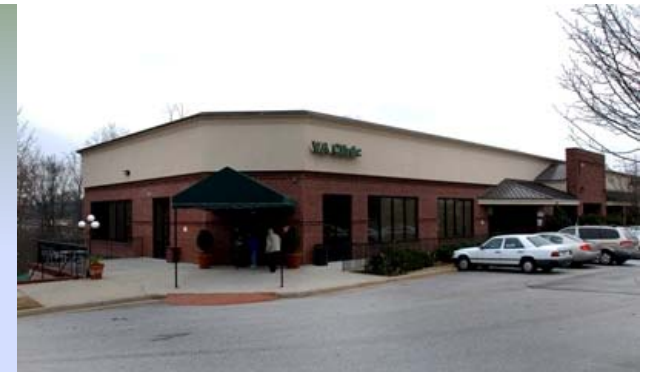
Lawrenceville CBOC 1970 Riverside Pkwy Established in 2001