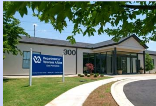
East Point CBOC 1513 Cleveland Avenue Established in 2005