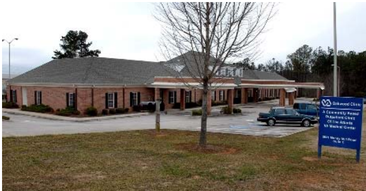
Oakwood CBOC 3931 Mundy Mill Road Established in 2000