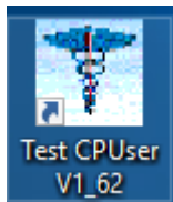
Figure 1: Shortcut Icon for Test CP User v1_62