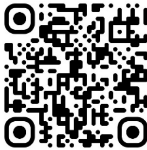
GPD Website Scan Me

Copies of the application materials and technical assistance resources are available on the GPD website at https://www.va.gov/homeless/gpd.asp . You may use the QR code to access the GPD website.