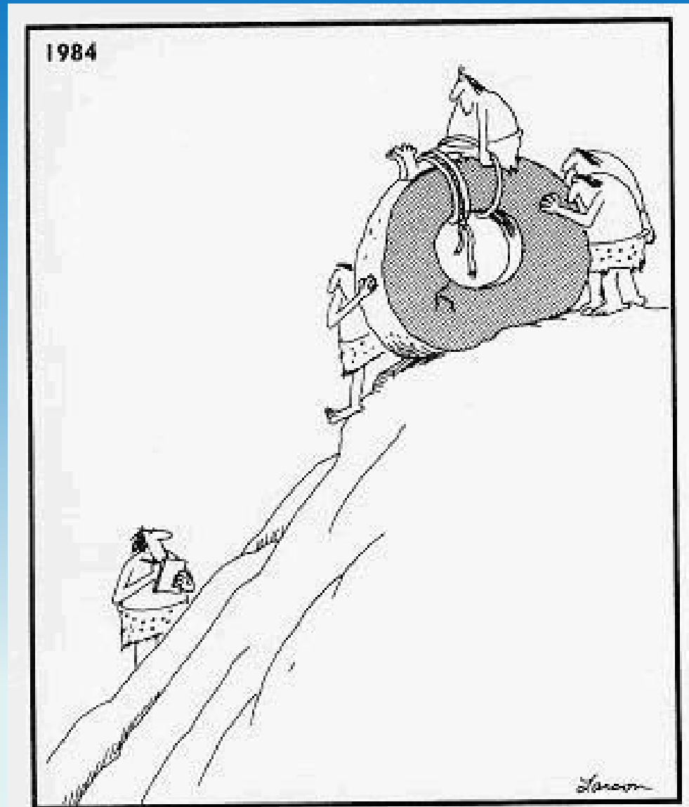
Early experiments in transportation