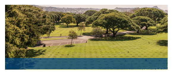
FAQ's from the VA Survivor's Assistance Program