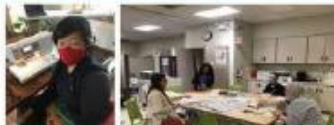
Puget Sound VA OTs leading facility mask making project

Minneapolis VA iPad Video Monitoring & Assessment (iVMA) Pilot Program