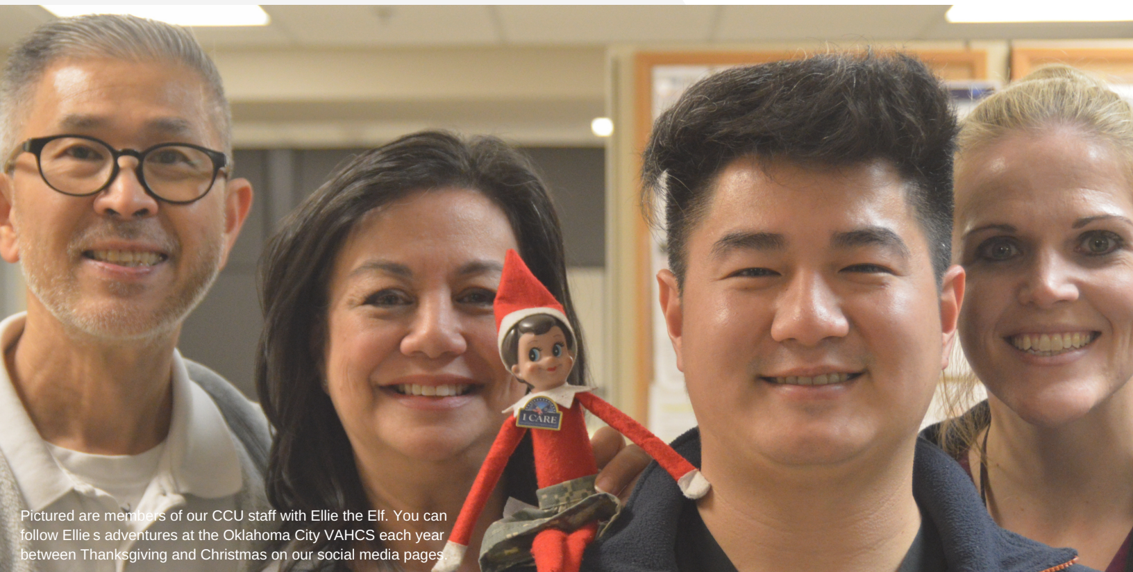
Pictured are members of our CCU staff with Ellie the Elf. You can follow Ellie's adventures at the Oklahoma City VAHCS each year between Thanksgiving and Christmas on our social media pages.

Our anchor facility is a 178-bed medical center located in the heart of Oklahoma City. We are a teaching hospital, providing a full range of patient care services, with state-of-the-art technology as well as education and research. Comprehensive health care is provided through primary care, tertiary care and long-term care in the areas of medicine, surgery, psychiatry, physical medicine and rehabilitation, neurology, oncology, dentistry, geriatrics, and extended care. Specialized programs include Mental Health Intensive Case Management (MHICM), Reaching Out to Educate and Assist Health Care Families (REACH), Compensated Work Therapy, Center for Alzheimer and Neurodegenerative Diseases (CANDO), and Animal Assisted Therapy.