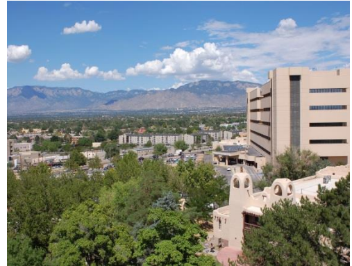
New Mexico VA Campus

The New Mexico VA Health Care System (NMVAHCS) is a Joint Commission accredited, VHA complexity level 1b, tertiary care referral center that also serves as a large teaching hospital affiliated with the University of New Mexico. The NMVAHCS serves all of New Mexico along with parts of southern Colorado, western Texas, and eastern Arizona via 13 Community-Based Outpatient Clinics (CBOCs). Inpatient services include 184 acute hospital beds (including a 26 bed Spinal Cord Injury Center), 90 residential rehabilitation treatment program beds (including a 26 bed Psychosocial Residential Rehabilitation Treatment Program [PRRTP], a 24 bed Substance Abuse Residential Rehabilitation Treatment Program [SARRTP], a 40 bed Domiciliary RRTP), and a 36-bed Palliative Care and Community Living Center Unit. The NMVAHCS has multiple specialized programs including outpatient traumatic brain injury program (polytrauma support clinic), acute psychiatric hospitalization, a sleep medicine center, a psychosocial rehabilitation program, and interdisciplinary pain rehabilitation services.