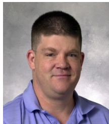
Information System Security Officers