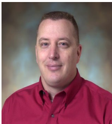
IT Area Manager