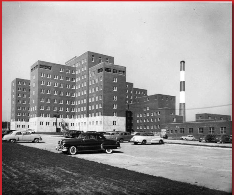
A look back - pictured is the medical center in Ann Arbor shortly after opening in 1953.