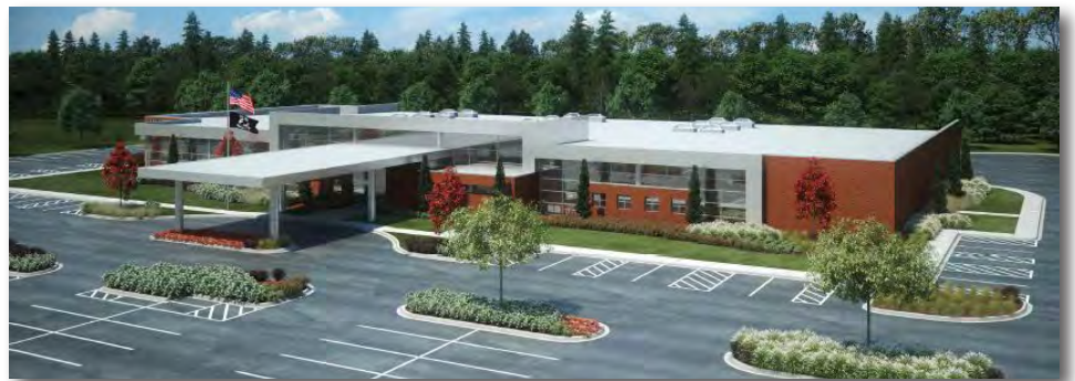
Architectural rendering of Canton CBOC

Once built, the almost 40,000 square foot clinic will serve Veterans in Western Wayne County, and will allow for the full implementation of the Patient-Aligned Care Team (PACT) model of care delivery, improving operational efficiencies and the Veteran experience. Not only will the new clinic provide Primary Care, but it will also include Mental Health, Laboratory and Pathology, and Imaging services to Veterans in a right-sized, state-of-