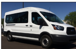
Golden Gate Shuttle