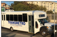
Daly City Shuttle