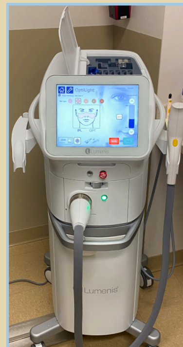
Intense Pulsed Light for dry eye treatment

The IPL quells the inflammation and boosts the oil production of the glands to mitigate dry eye.