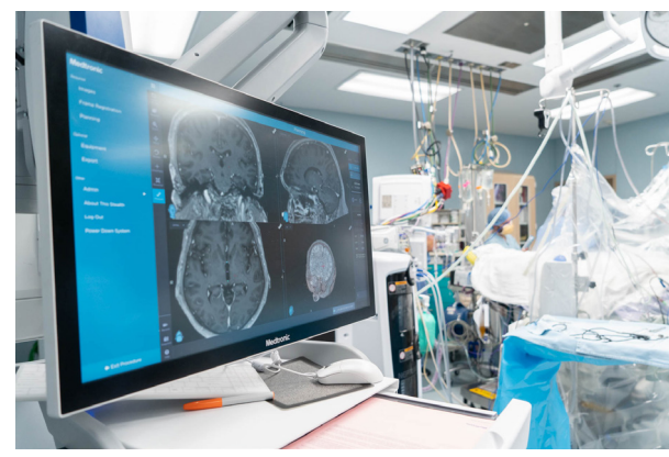
Image of a computer screen with brain images in the operating room.

The pulse generator sends electrical signals through a wire to an electrode implanted in the brain to help improve symptoms.