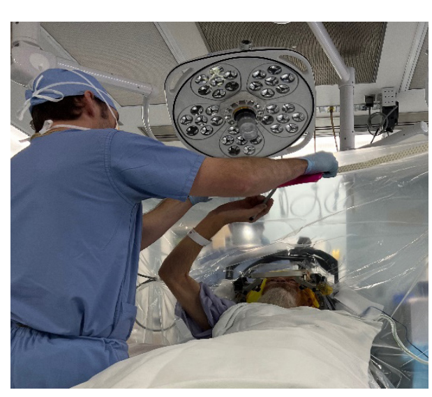
Image of a Veteran performing a writing task with staff to test electrode placement during surgery.

A surgical treatment option for Veterans with Movement Disorders offered through the Minneapolis VA Health Care System