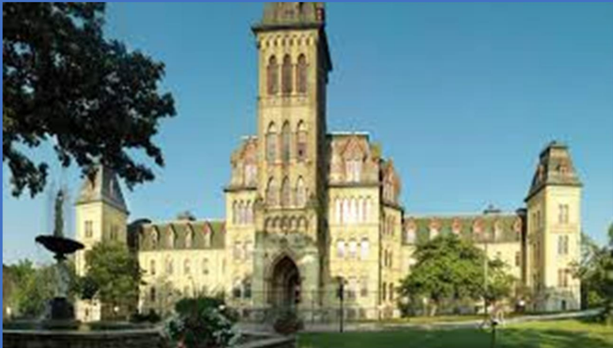
Clement J. Zablocki VA Medical Center Milwaukee, Wisconsin