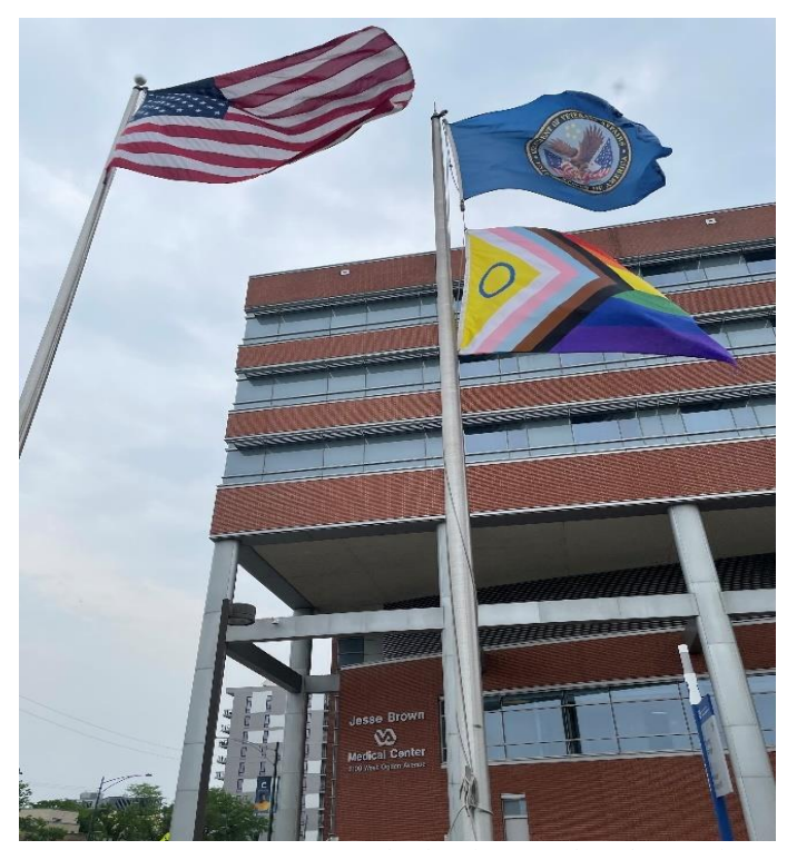
Photo of the exterior of Jesse Brown VAMC in the background with two flagpoles and three flags flying, the United States of America Flag on the flagpole on the left, and the Department of Veterans Affairs Flag (top), and the Progress Pride Flag (bottom) on the flagpole on the right.

Additionally, there is strong cultural pride that exists within the city's ethnic neighborhoods and LGBTQ+ communities. Further information about Chicago is available at <a href="https://www.CityofChicago.org">www.CityofChicago.org</a>.