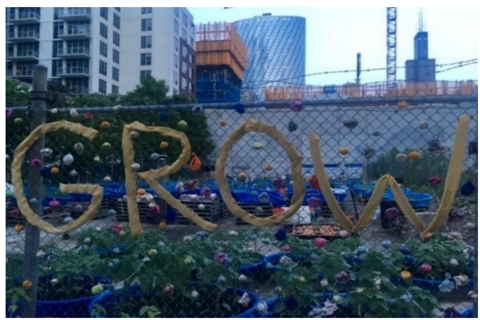
Photo of community garden with buildings in the background in Chicago