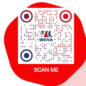
Washington State Department of Veteran Affairs