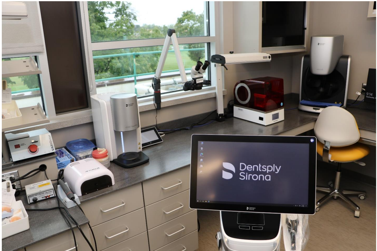
State of the art lab