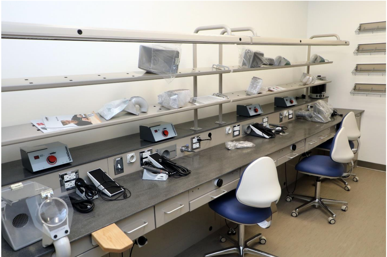
State of the art lab