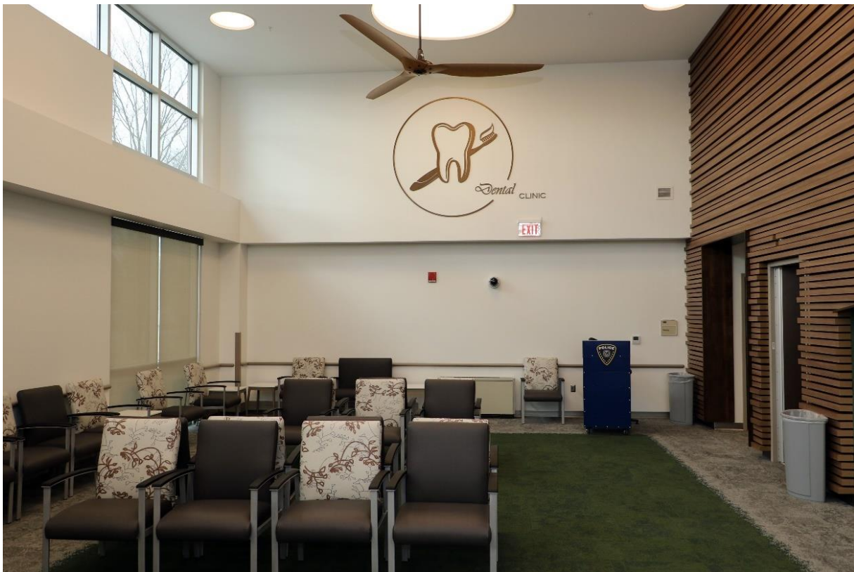
Welcoming lobby and functional conference room

Visit: https://www.va.gov/martinsburg-health-care/work-with-us/internships-and-fellowships/advanced-education-in-general-dentistry-residency-program/