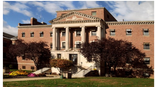
Montrose Campus 2094 Albany Post Road Montrose, NY 10548