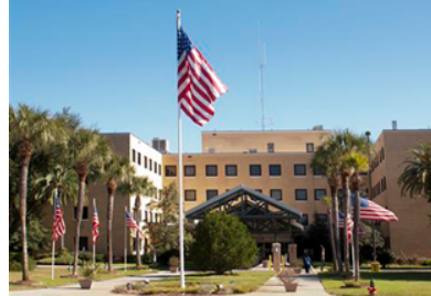
Lake City VAMC