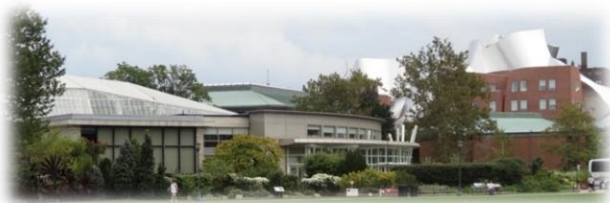
View of Cleveland Botanical Garden and Case Western Reserve at University Circle

The Cleveland VA Medical Center is a 2022 Top Performer in LGBTQ Healthcare Equality (HEI). Chaplain Service supports religious diversity with staff spiritual consultation in major religions and through community partnerships for religions not represented among staff. They have won a Best Practices Award in spiritual assessment.