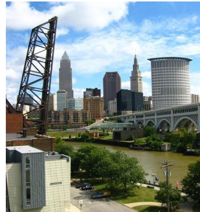
View of Downtown Cleveland

Severance Hall at University Circle is the winter home of the Cleveland Orchestra , one of the world's finest. In the summer the orchestra plays at Blossom Music Center, also a major outdoor venue for rock concerts. Cleveland's music scene stretches across a multitude of genres and venues including the Rock and Roll Hall of Fame , Cain Park Arts Center , Beachland Ballroom , House of Blues and many other intimate nightclubs featuring big name acts. The Scene Magazine keeps the pulse of the local entertainment scene, reporting on venues and styles to suite many different tastes. Playhouse Square is the largest performing arts center outside of New York, and hosts dozens of productions yearly including Broadway greats and nationally touring celebrities.