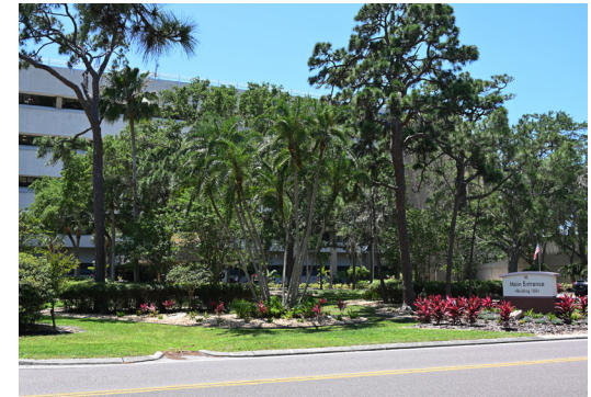
The main hospital building at the Bay Pines Campus.