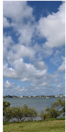
From the Bay Pines Campus, overlooking Boca Ciega Bay