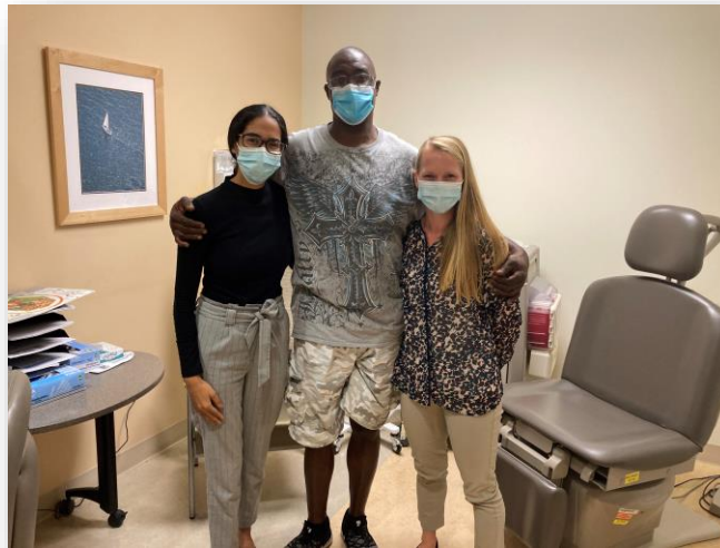
Resident, Veteran & Pharmacist

Anticoagulation Block and Longitudinal Rotations –The resident will work daily for 4-6 weeks in the Anticoagulation Clinic for the initial block rotation. VA providers refer anticoagulated patients to the Anticoagulation Clinic where CPPs perform anticoagulation initiation and monitoring. Point of care machines are used for warfarin therapy and pharmacists make dose changes with patients during appointments. The rotation will focus on the management of warfarin, direct oral anticoagulants (DOACs) and proper use of