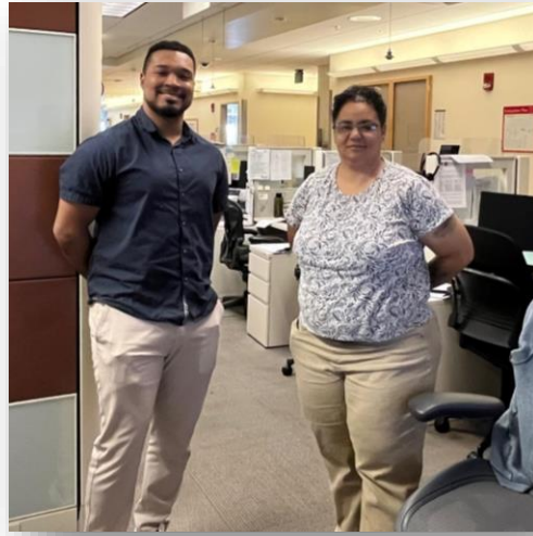
Medical Scheduling Assistants

Endocrinology - Opportunities may exist for the pharmacy resident to work in specialist clinics with the endocrinologist(s) and nephrologist(s) learning about specialized management of issues pertaining to diabetes (insulin pumps, U500 insulin, type 1 diabetes, and use of continuous glucose monitors), hyper/hypothyroidism, hormone imbalance, resistant hypertension, and chronic kidney disease. This elective rotation will occur 1 day per week for 8-10 weeks.