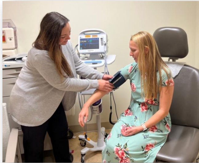
Pharmacist checking blood pressure

Drug Policy –The resident will spend time working with the Associate Chief of Clinical Services longitudinal throughout the residency year(50-52 weeks). This rotation will take no more than ½ day per week and may have time separately assigned or may be combined with assigned project time. Pharmacists at the VA Ambulatory Care Center participate in activities to improve the quality of pharmaceutical care including adverse drug event reporting, medication error prevention, medication error reporting, and medication use evaluations. The Pharmacy and Therapeutics Committee is responsible for local management of the VA national formulary, medication performance measures, and medication use evaluations.