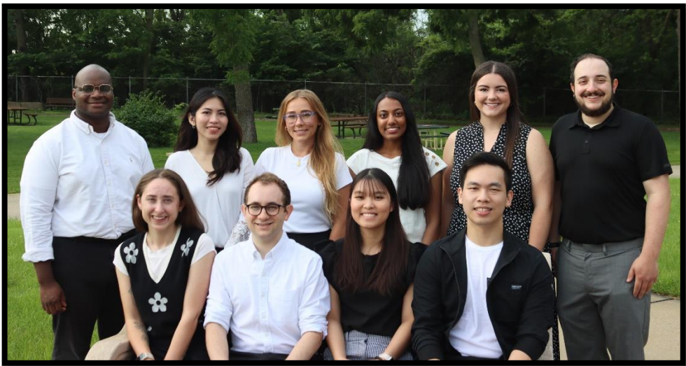
PGY-1 and PGY-2 residents