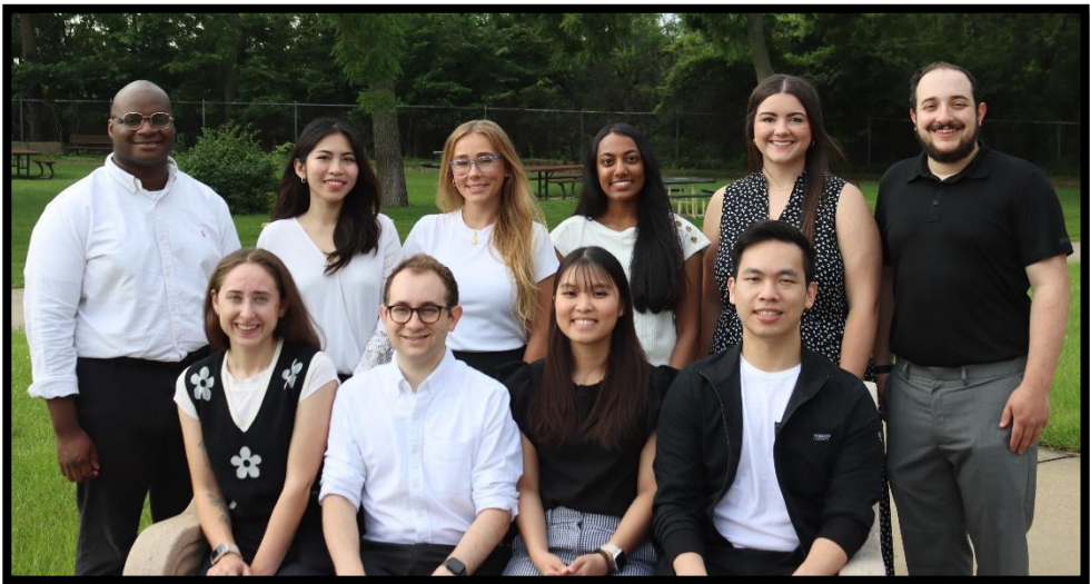
PGY-1 and PGY-2 Resident Class of 2024-2025