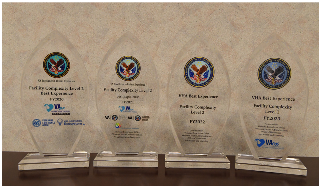
Patient Experience Awards.

Lebanon VAMC and its community clinics were once again named the top VA Medical Center in the United States, for patient experience. The facility achieved the highest overall combined patient experience and employee experience scores of all complexity level 1 facilities in the Veterans Health Administration (VHA). This is the fourth consecutive year Lebanon has received the prestigious national honor. The facility received the award at a ceremony in September 2024.