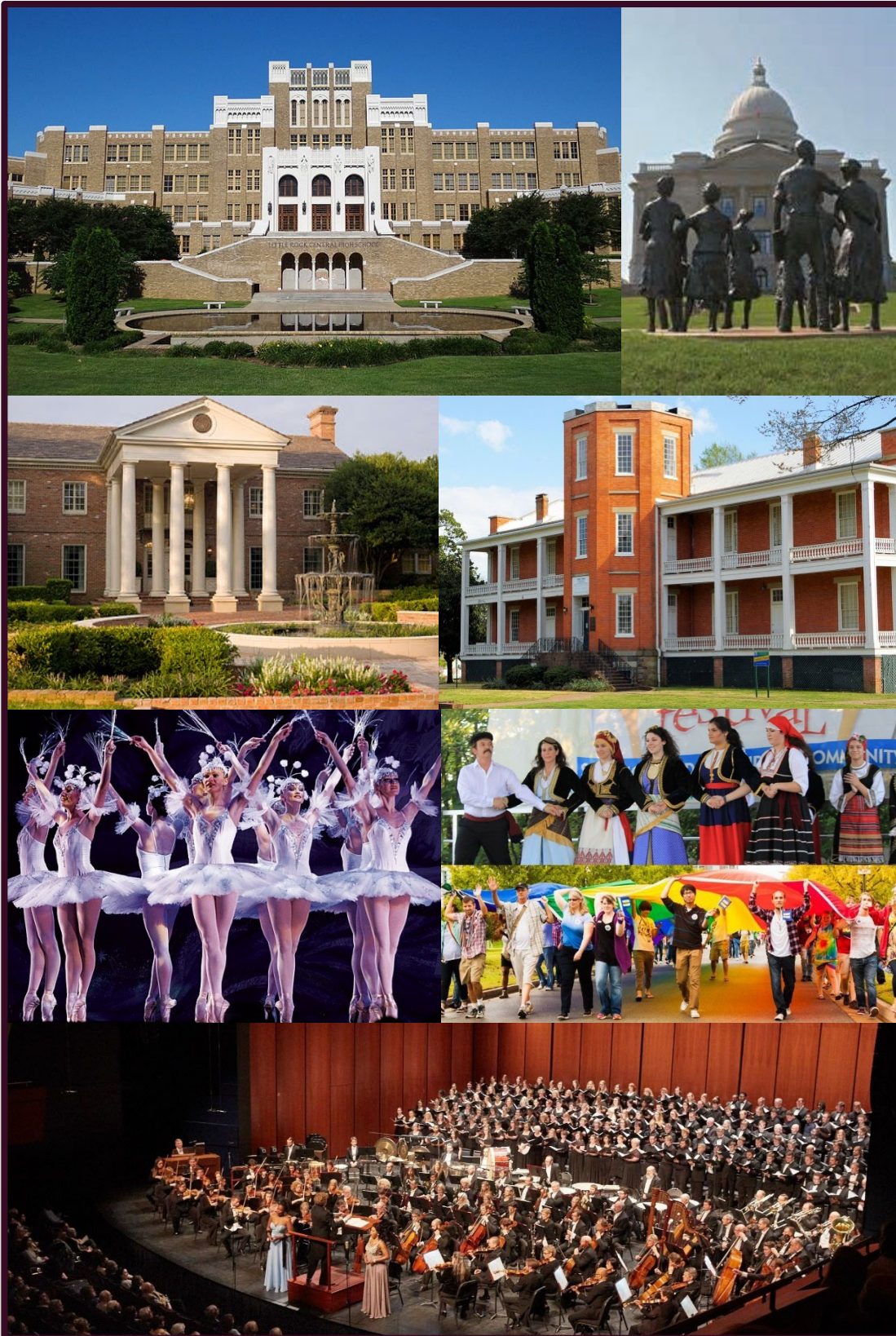
Central Arkansas is rich in History and Culture...