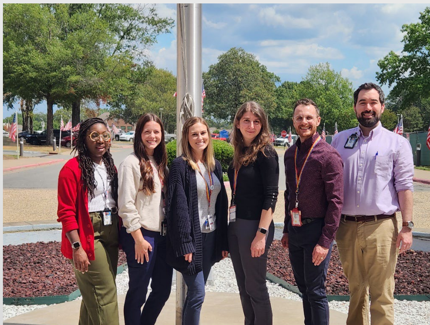
2024-25 Fellowship Class