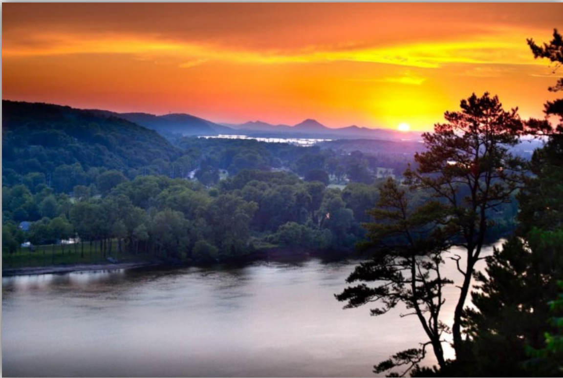
*A view from the Bluffs of the North Little Rock Campus (Fort Roots)