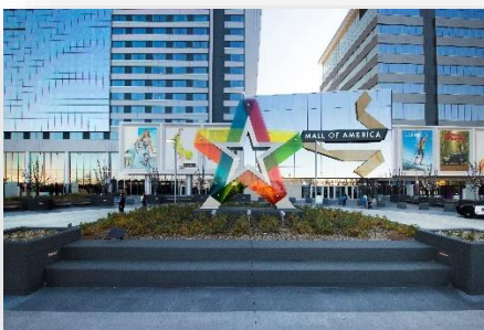
Mall of America