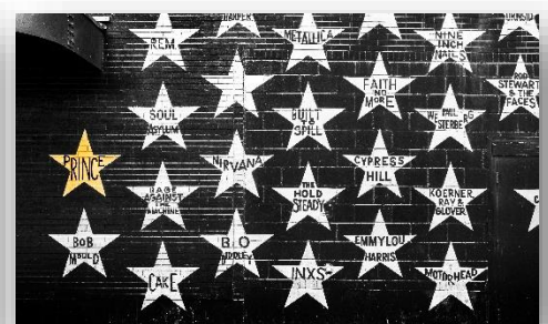
First Avenue Star Wall