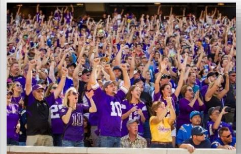
Vikings Football Fans