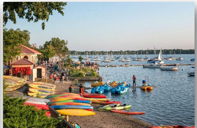
Lake Bde Maka Ska (Calhoun)