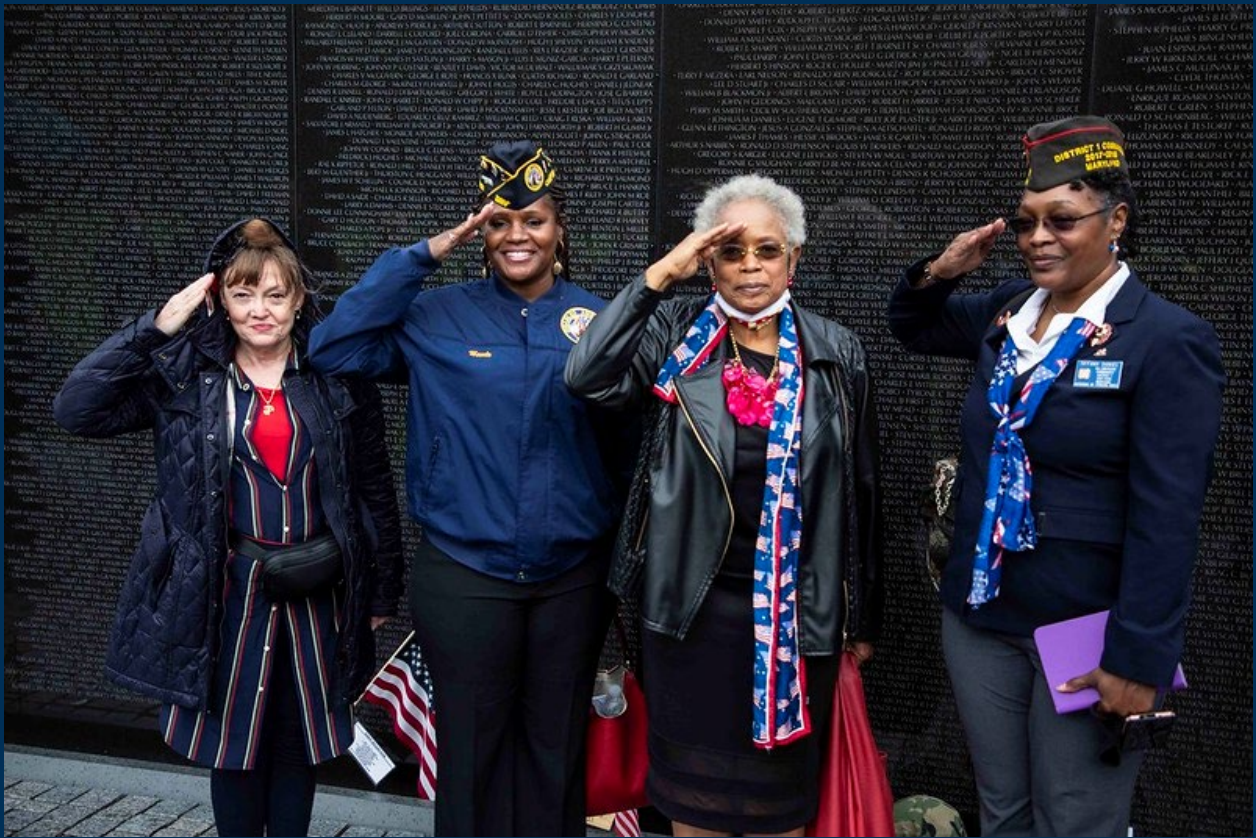
Veterans salute at the Vietnam Veterans Memorial in Washington, DC on May 31, 2021 in celebration of Memorial Day.