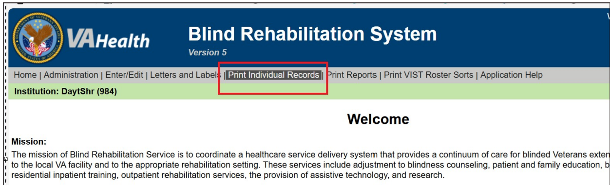
Figure 1 – tab link with visible focus