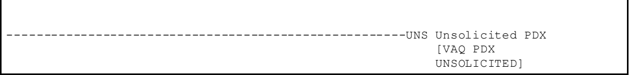
Figure 5-1: Exported options—Generated Menu Tree