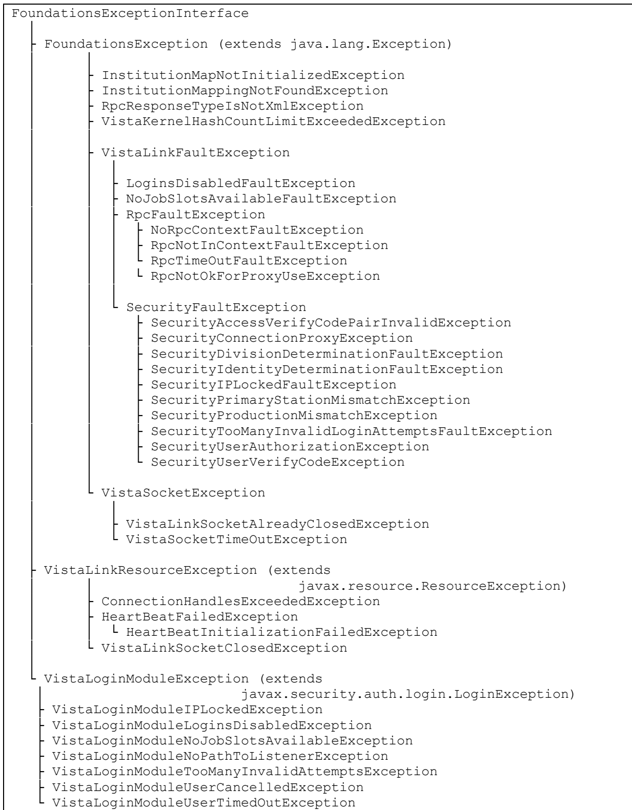
Figure 5-1. VistALink Exception Hierarchy