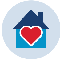
Community Veterans Engagement Boards (CVEBs)