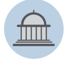
State Offices/NASDVA Governors/Mayors Challenge County VSO