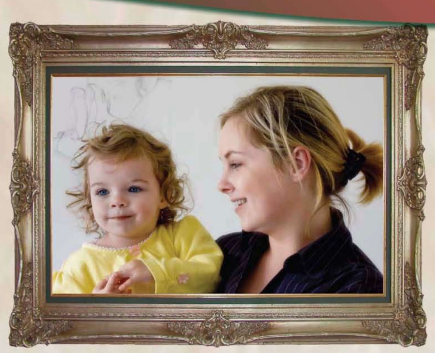
September 2008 Kids who grow up around cigarette smoke are more likely to have respiratory illnesses, bronchitis, ear infections, pneumonia, and chronic cough than kids who don't.

exposure to cigarette smoke is harmful to kids?