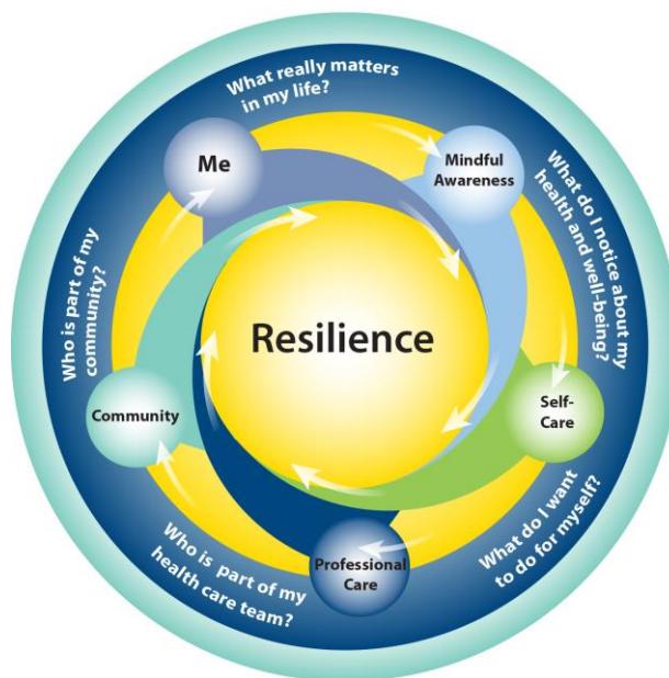
Figure 1. The Circle of Resilience.

Burnout is the shadow side of resilience . Resilience is defined as “the process of adapting well in the face of adversity, trauma, tragedy, threats, or significant sources of stress.”[35] Fostering resilience is central to the Whole Health approach, and it can be cultivated in a number of ways. A model for resilience can be drawn from the Circle of Health, as illustrated in Figure 1, below: