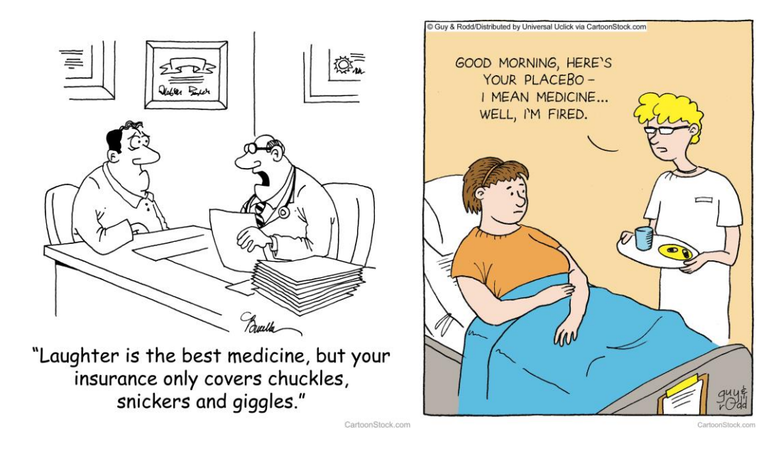
Figures 1 & 2.

to laugh at. And, in the process of copying the laughter, people start really laughing. To start this process, try a basic Laughter Yoga exercise like the one featured on the next page.